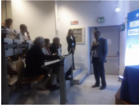
Fig 5: One of the Lecture rooms in action

Algorithm of DVT” (P. L. Antignani), “The advantages and des- advantages of NOAC” (C. Allegra) and “factors influencing re- canalisation of DVT and development of PTS” (L. Jeraj).