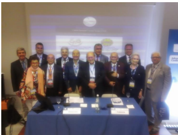
Fig 6: A group of presenters and discussers of the joint symposium organised with MLAVS

The scientific program included: (a) Joint Symposium about renal artery (b) Joint Symposium about Foam