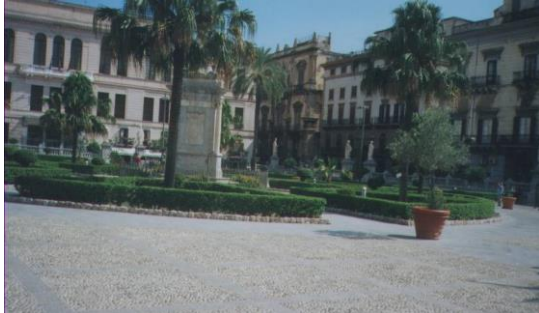
Fig 16: The Medieval Palermo

ESC Guidelines” (G. De Luca); The last 4 th lecture had the title “Treatment of chronic ischaemic heart disease: what is new?” (G. Calcaterra).