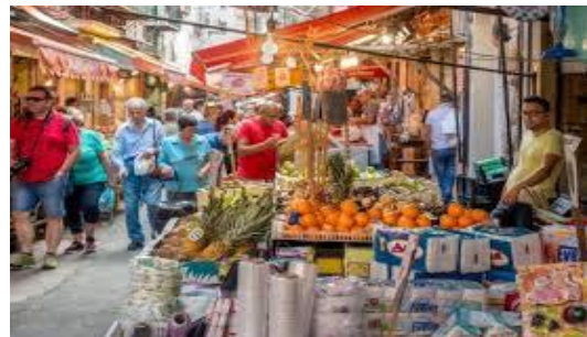
Fig 23: The open markets in Palermo are popular and many