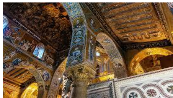
Fig 25: The roof of the magnificent church in the Royal Palace.