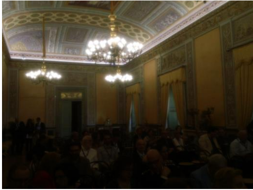
Fig 13: the blue room of the Rogial Palace where the opening ceremony took place

CLI” (A. Frasheri); the 4 th lecture “CLI: open or endovascular surgical approach?” (N. Angelides); and the last one “experience with Hybrid vascular graft in CLI” (G. Vettorello).