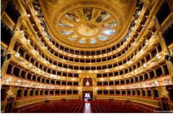
Fig 20: The Palermo's opera-house, where we enjoyed the opera "cavalleria rusticana" by P. Mascagni

The scientific program continued with another mini-symposium under the title "Lymphatic diseases". The 1 st lecture dealt with "the primary and secondary Lymphoedema: from genetics to the clinic" (A Fiorentino); The 2 d lecture dealt with "Secondary peripheral lymphoedema: New concepts of prevention, staging-guided surgical treatment and long-term clinical outcomes" (C. C. Campisi)