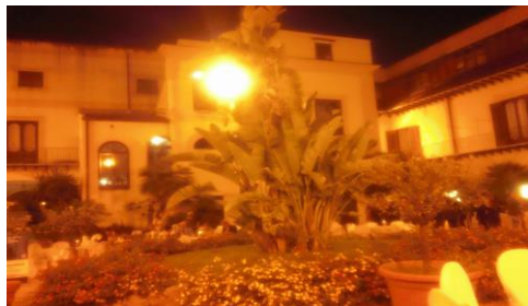
Fig 10: The official dinner’s place