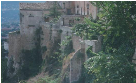
Fig 17: The Acropolis of Palermo

The next joint symposium had the title: “ Preclinical carotid atherosclerosis ”. It included the following lectures: 1 st one was on “carotid biomarkers” (A. Visona). The 2 d lecture was on “IMT: from clinical trials to the real life” (M. Amitrano). The 3 d one “Ultrasound measurements of carotid damage” (G. Lessiani). Finally the 4 th , deals with the “relationship between endothelial dysfunction, erectile dysfunction and Testosterone levels” (R. Iacona).