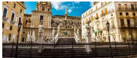
Fig 24: Churches and statues in Palermo.