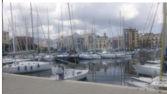
Fig 2: Palermo: View of the marina