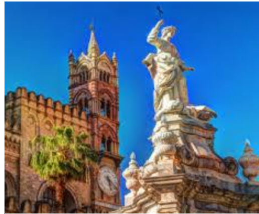
Fig 22: The medieval Palermo