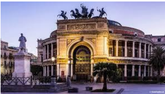
Fig 21: the magnificent Palermo

The scientific program continued with another mini-symposium under the title "Lymphatic diseases". The 1 st lecture dealt with "the primary and secondary Lymphoedema: from genetics to the clinic" (A Fiorentino); The 2 d lecture dealt with "Secondary peripheral lymphoedema: New concepts of prevention, staging-guided surgical treatment and long-term clinical outcomes" (C. C. Campisi)