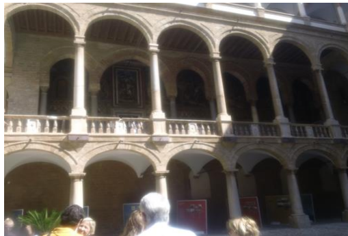
Fig 3: “Palazzo del Normanni” Venue of the Opening Ceremony.

The beautiful town of Palermo has been selected several times as the venue of vascular and cardiovascular Congresses. (2000, 2005 and 2009, 2014). The city is a patchwork of periods and styles and its historic centre fuses ancient splendour. Arab and Norman treasures are mingling with misery! Palermo however offers a special sensibility and an excellent hospitality, which flows in the air and is absolutely unique.