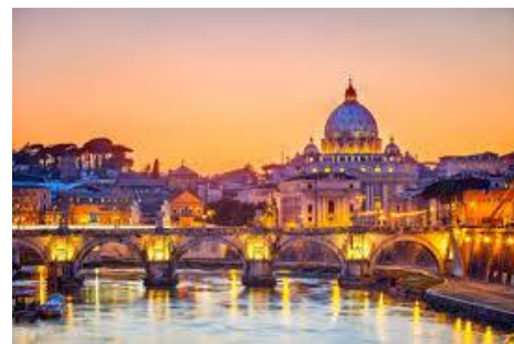
Fig 1: Palermo at night

*Report: on the 28th MLAVS Congress- Palermo, Italy. *Future MLAVS Meetings.