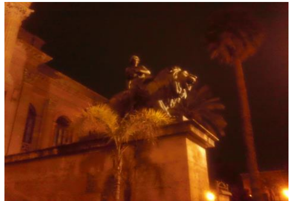
Fig 12: Palermo at night

1 st Lecture was on “mechanical thrombectomy” (S. Pataki); 2d one “new concepts on pathophysiology and treatment” (G.H. Schernthaner); 3d one “Variability in vascular care focusing on limb amputations” (E. Kolossvary); 4 th lecture “Why treatment of PAD is still non-optional” (J. Pitha); 5 th one “rehabilitation in PAD” (L. Mazzolai); and the final one “Observational studies on PAD in Italy” (A. Visona)