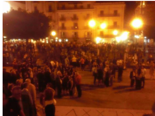
Fig 7: Night-life is intensive in Palermo’s squares and narrow streets

The scientific program continued with The following plenary lectures :