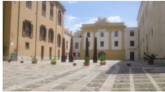
Fig 11: Typical “piatza” of Palermo