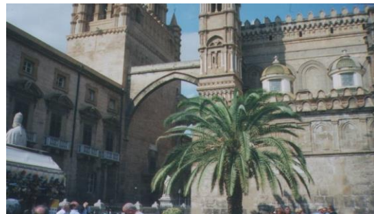
Fig 15: The medieval Palermo