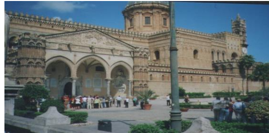
Fig 14: The Palermo’s Cathedral.

cardiovascular prevention in patients with PAD effective?” (A. Blinc); the 3d lecture had the title “Novel approaches to interventional treatment of CLI” (V. Boc); Finally, the 4 th lecture had the title “Future directions of integrative vascular medicine” (M. Sabovic).