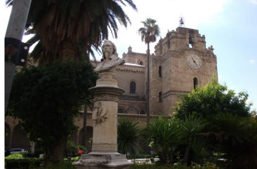
Fig 18: The old Palermo

Failure with preserved but reduced ejection fraction: the misleading definition of the new guidelines” (F. Fedele).