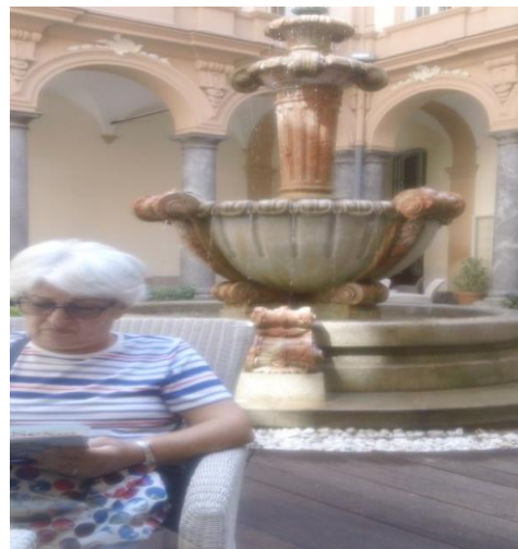
Fig 19: The atrium of hotel Basra

A non-CME symposium followed supported by Novartis under the title “ Advances on the treatment of heart Failure ”. Four lectures were included. The 1 st one was about epidemiology (M. G. Abrignani). The 2 d lecture about “Pathophysiology and the role of natriuretic peptides” (G. Carmina). The 3 d , about “left ventricular dysfunction and anticancer drugs” (G. Novo) and the 4 th about “New treatment of heart failure with Neprilysin” (A. Tuttolomondo).