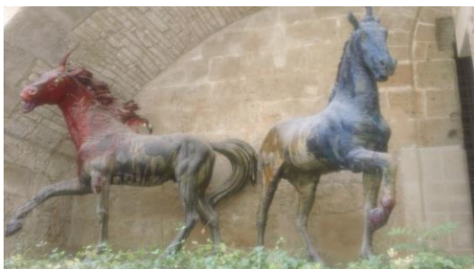
Fig 6: The statues in Palermo are numerous, including horses!

The next symposium was an extension of the previous one ( PART 2 ) under the same title. The 1 st lecture was about the “Venous Sludge index” (C. Latimer) the 2 d about “the principles of accurate diagnosis” (J. Michiels), the 3 d about “the post-thrombotic syndrome and its pri care” (J. Michiels) the 4 th about “Possible strategies for therapy in the VTE” (C. Andreozzi) and the 5 th about “Compression in Phlebology).