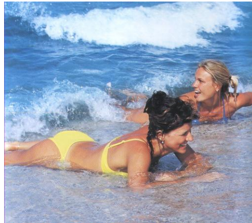
Fig 11: The sparkling Mediterranean Sea in Crete