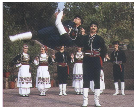
Fig 3: Local dance “pendozali” presented during the opening ceremony

The opening Ceremony took place at the historical “koules” Fortress in Heraklion port (Fig.2).