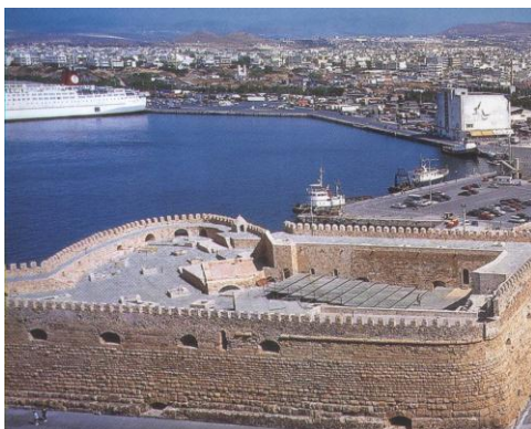
Fig 2: The Castle of Heraklion

The 16 th Mediterranean Congress of Angiology and Vascular Surgery took place in the conventional centre of the Hotel Creta Maris in Heraklion, which is the largest urban centre of Crete, the capital of the island and its financial centre. During the Minoan period the town served as a port to Knossos, and since then became the host of varied cultures and civilizations, whose marks are visible in the form of castles walls, palaces, fountains and other monuments. Crete combines in a harmonious way myth and culture. The ancient Greek pantheon has deep roots in the solid relationship of the Minoan civilization. Here is the holy mountain of Ida with the Dictean Cave where each spring Zeus, the father of gods, is reborn. Here gods, goddesses and heroes balanced brilliantly between godhood and the human temper. Knossos, is the centre of the great Minoan civilization. A visit to the royal palace of king Minos and the labyrinth , which is associated with Ariatne and the minotaur are unforgettable.