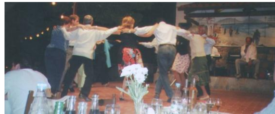
Fig 9: Participants dancing a quick Greek dance.

presented by B. Sumbio. The Program continued with a Satellite Symposium on “Adiposity”. Firstly, “Novel cardiovascular risk factors” were presented by N. Nicolaides. Then the lecture “The direct link between obesity and cardiovascular disease” was presented by S. Konstandinides, and the symposium closed with a lecture by S. Novo under the title “Multifocal atherosclerosis worsens the outcome of patients with acute and chronic coronary disease” The scientific program ended with a “Cretan Evening Excursion” in Arolithos Village. (Fig 9 and 10)