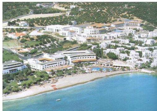
Fig 7: The venue of the Congress: The Creta Maris Complex.