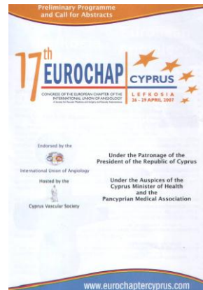
Fig 13: The next EUROCHAP in Cyprus: Second announcement and preliminary program

The 18 th EUROCHAP will take place in Sicily in 2009. President: Prof S. Novo