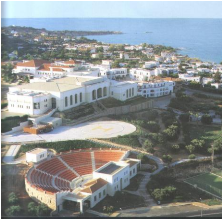
Fig 8: The conference centre and the near by open air amphitheatre

the following lectures brought this discussion to an end: “Update on ESFAR” by G. Hoffman, and “News from consensus document on intermittent claudication from the Central European Vascular Forum” presented by G. M. Andreozzi.