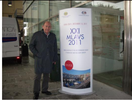
Fig 3: The President of MLAVS at the entrance of Museo del Mare.

The scientific program was excellent. It was equally divided in two large rooms, the Vespucci saloon and the auditorium , and was composed of forum lectures, jointed symposia, round tables, and paper sessions which covered the up to-day vascular and endovascular surgery, as well as cardiovascular medicine, phlebology and lymphology in a step by step manner. The main symposia gave an answer to what is new in carotid and peripheral arterial disease, what's new in aortic surgery (thoracic, thoraco-abdominal and abdominal aorta), as well as what are the latest steps and new horizons in angiology, cardiovascular medicine, phlebology and lymphology. It is of importance to say that the way it was presented Lymphology in this Congress, was something new for many participants. The amazing was that this "extended" lymphology did not affect at all the other vascular components of the scientific program and it was definitely something that was missing from previous MLAVS Congresses. All summaries are included in the last issue of ANGIOLOGY (sublimate), and anyone can read them and use them as reference.