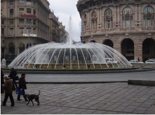
Fig 8: The central square of Genoa