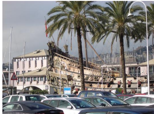
Fig 9: Another spot of the old harbour and the uphill town of Genoa