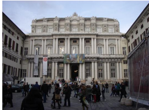
Fig 8 Central spot of Genoa