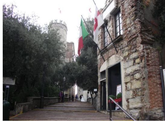
Fig 5: The house of Christopher Columbus