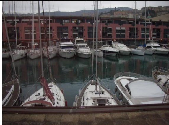
Fig 6: The Marina infrant of the Museo del Mare