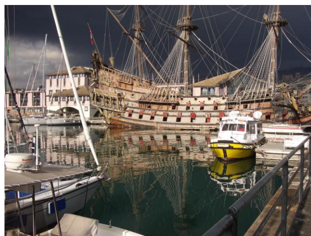
Fig 1: A spot from the old harbour of Genoa.